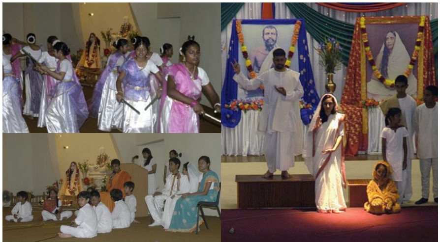
At Sri Sarada Devi Ashrama Mother's children honor Her with multi-faceted cultural celebrations.

The Sri Sarada Devi Ashram in South Africa is a thriving embodiment of the Holy Mother's simple and far-reaching embrace and remains testimony to Mother's reassurance when she said, "I am the mother of the virtuous, I am the mother of the wicked. Whenever you are in distress say to yourself, 'I have a Mother.'"